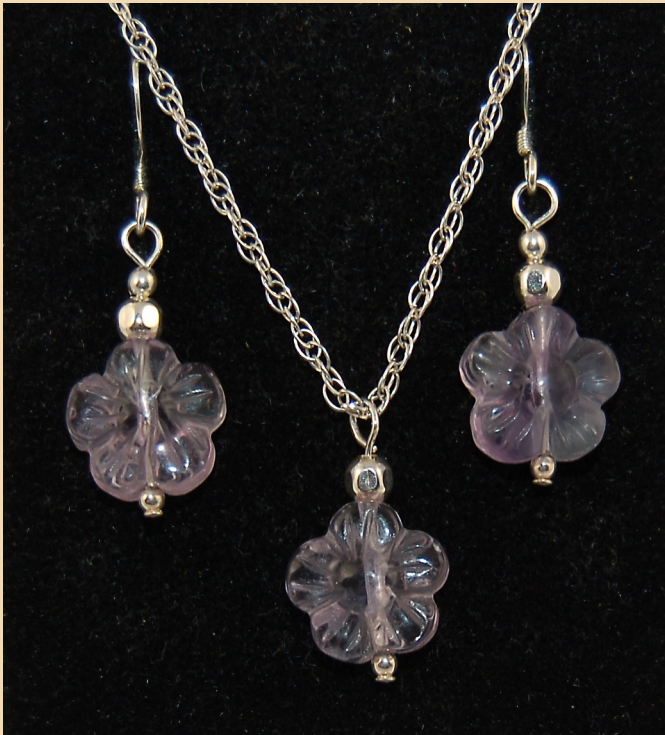
SSET 1 Purple Fluorite flowers and Sterling Silver, pendant and earrings £50