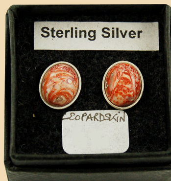
SS5 Leopardskin Jasper oval and Sterling Silver £28