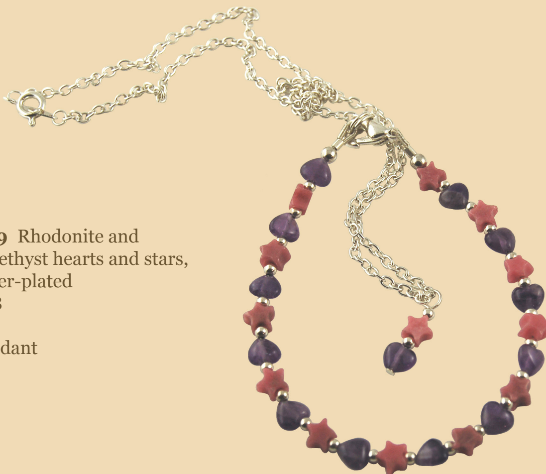
SB9 Rhodonite and Amethyst hearts and stars, silver-plated £38