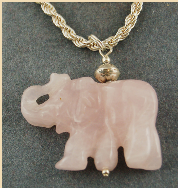
SP4 Rose Quartz carved elephant and Sterling Silver £65