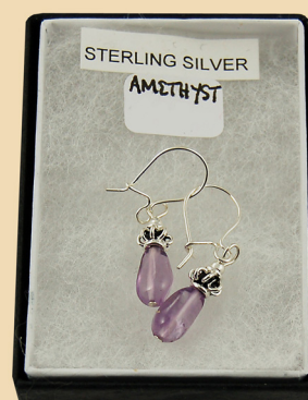
SE12 Amethyst small drops and Sterling Silver £21