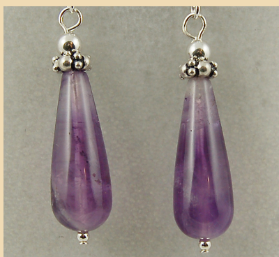
SE11 Amethyst drops and Sterling Silver £30