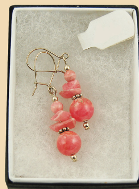
SE15 Rhodochrosite beads and chips and Sterling Silver £22