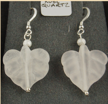
SE4 Frosted Rose Quartz carved leaves and Sterling Silver £24