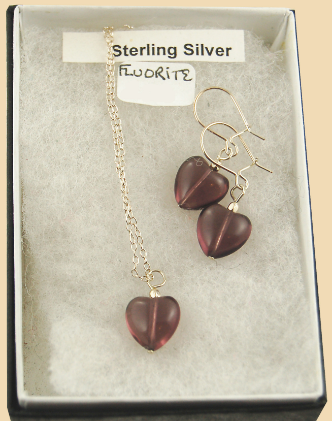
SSET 3 Aubergine Fluorite hearts and Sterling Silver, pendant and earrings £40