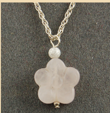
SP7 Rose Quartz carved flower and Sterling Silver £30