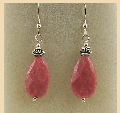
SE9 Rhodonite faceted teardrops and Sterling Silver £24