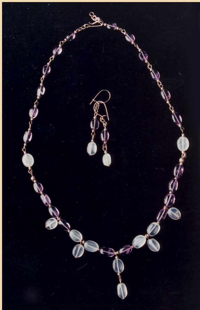
SN13 Amethyst and Moonstone ovals linked with drops, silver-plated. £70