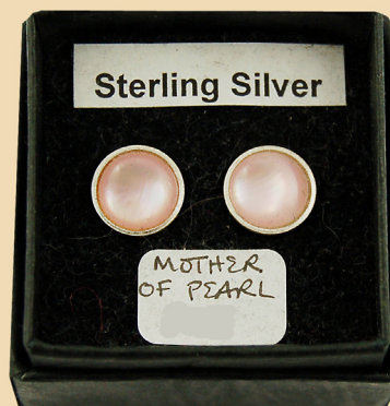
SS8 Pink Mother of Pearl round and Sterling Silver £26