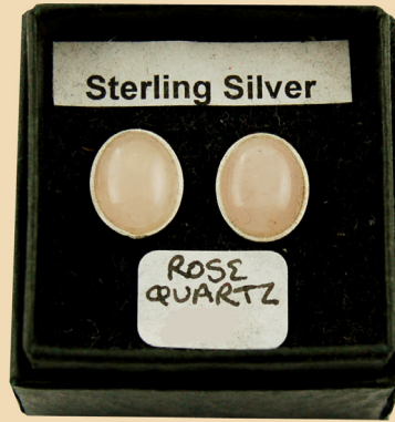
SS2 Rose Quartz oval and Sterling Silver £28