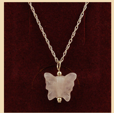
SP3 Rose Quartz butterfly and Sterling Silver £25