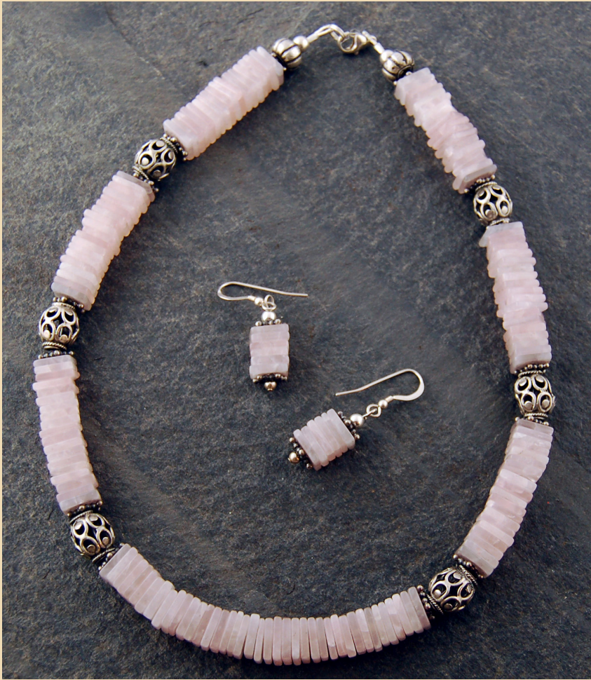
SN 7 Rose Quartz square tiles and Sterling Silver £150