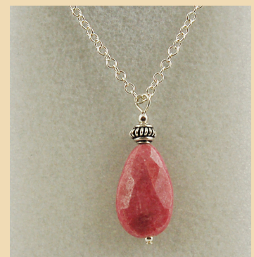
SP9 Rhodonite faceted teardrop and Sterling Silver £28