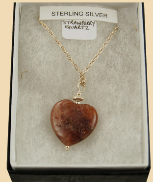
SP12 Strawberry Quartz large heart and Sterling Silver £30