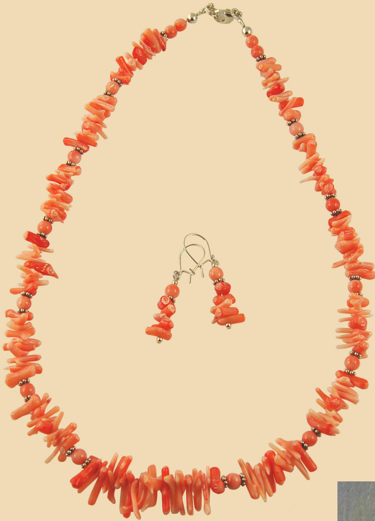
SN11 Pink Branch Coral and Sterling Silver £92