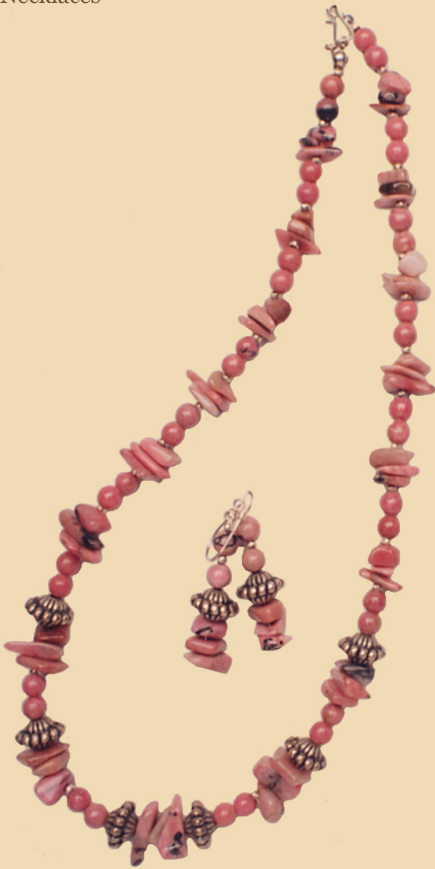
SN15 Rhodonite chips, silver-plated £50