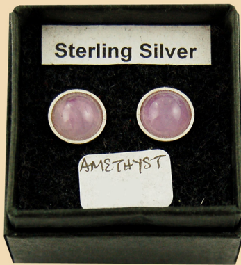
SS1 Lavender Amethyst round and Sterling Silver £28