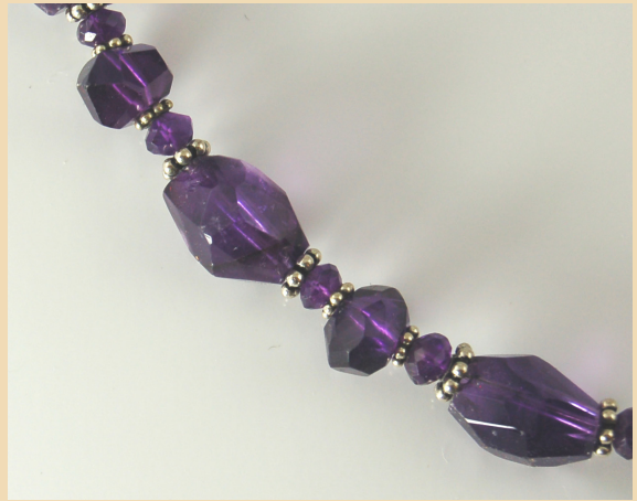
SN3 Amethyst faceted nuggets and Sterling Silver £115