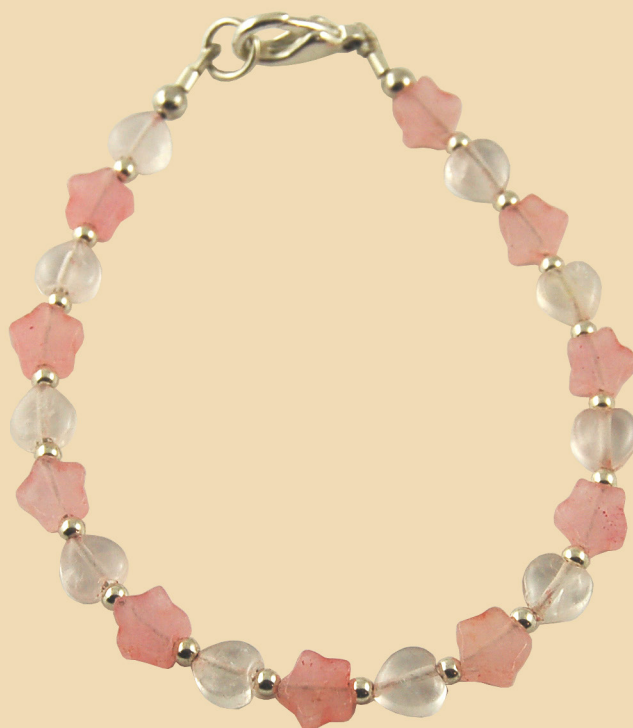
SB7 Pink Quartz hearts and stars, silver-plated £38