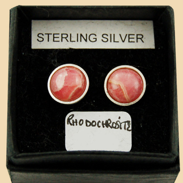
SS9 Rhodochrosite round and Sterling Silver £36