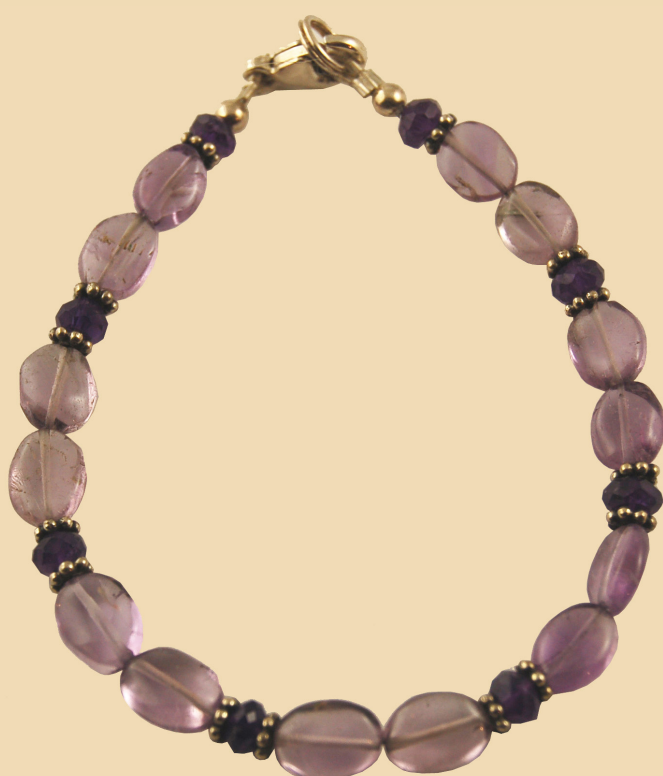
SB3 Amethyst ovals and faceted Garnet and Sterling Silver £50