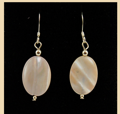
SE6 Pink Shell ovals and Sterling Silver £22