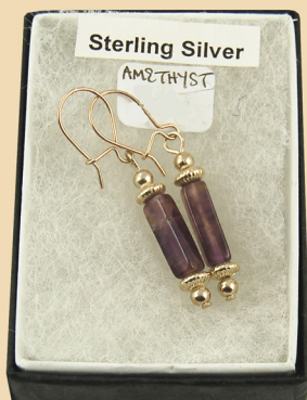
SE13 Amethyst cylinders and Sterling Silver £24