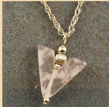
SP5 Rose Quartz 'V' shape and Sterling Silver £30