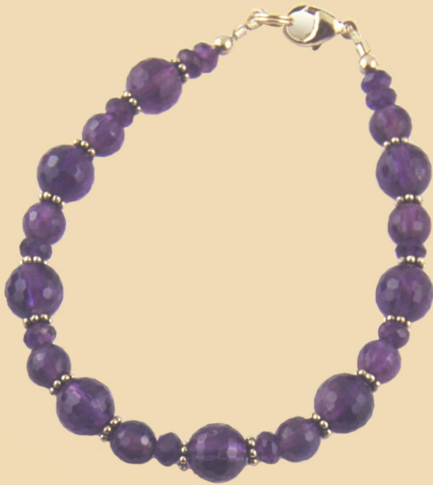
SB5 Faceted Amethyst beads and Sterling Silver £50