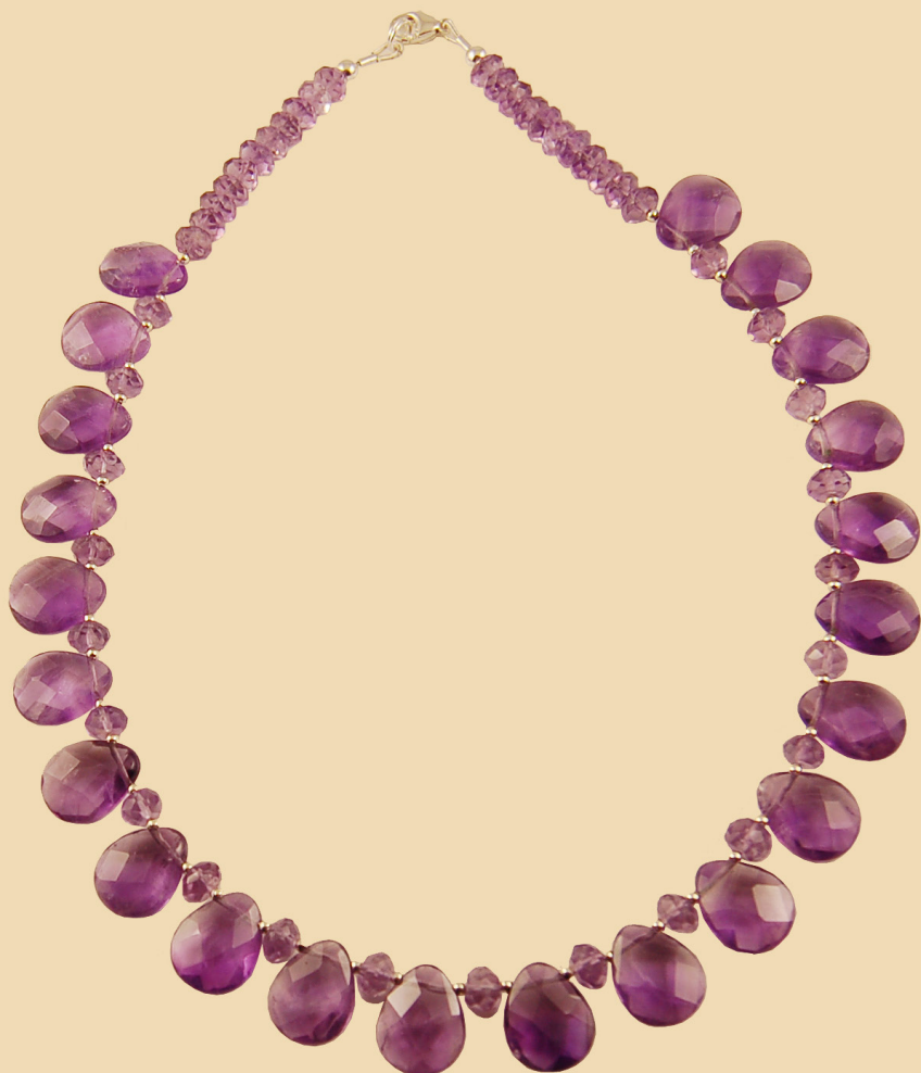
SN5 Faceted Amethyst teardrops and beads and Sterling Silver £130