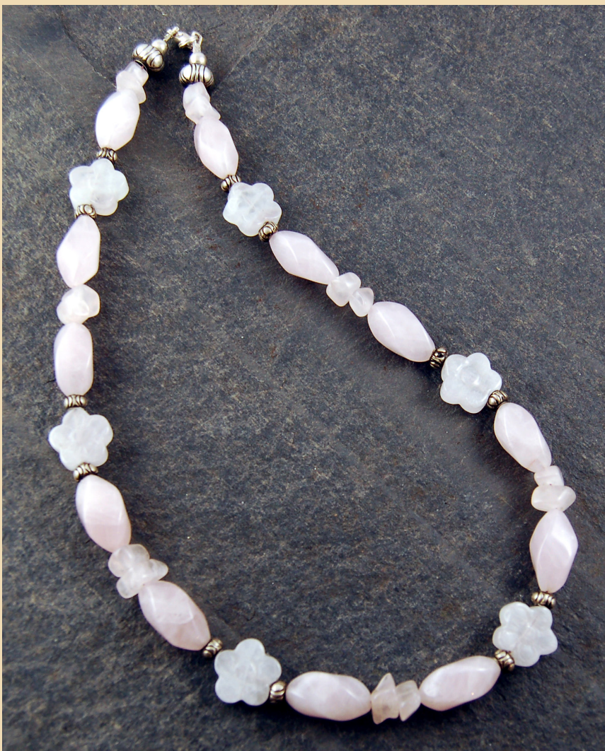
SN8 Rose Quartz flowers and twisted barrels and Sterling Silver £68