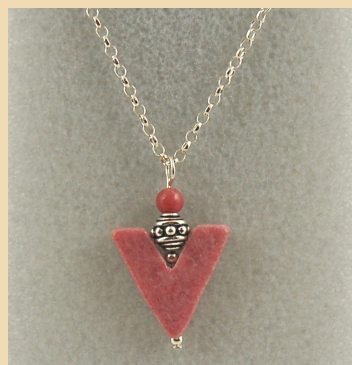
SP8 Rhodonite 'V' shape and Sterling Silver £28