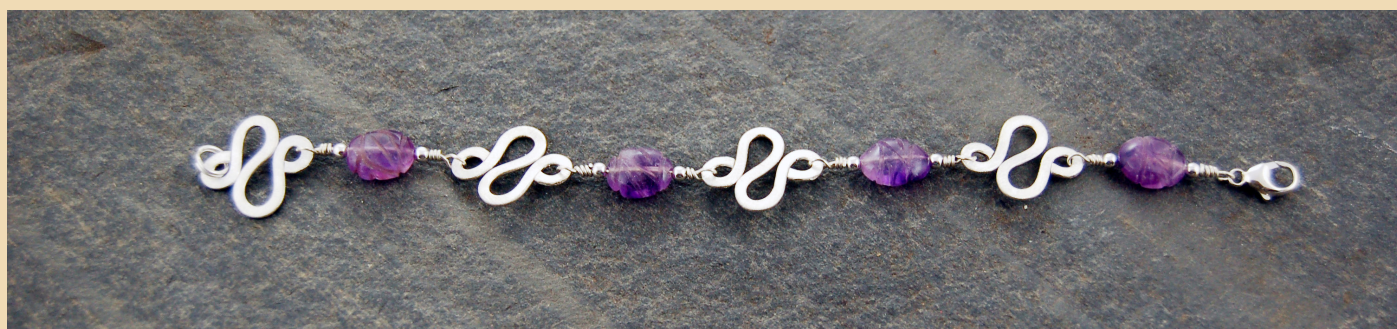
SB2 Carved Amethyst ovals with frosted and hammered Sterling Silver squiggles £80