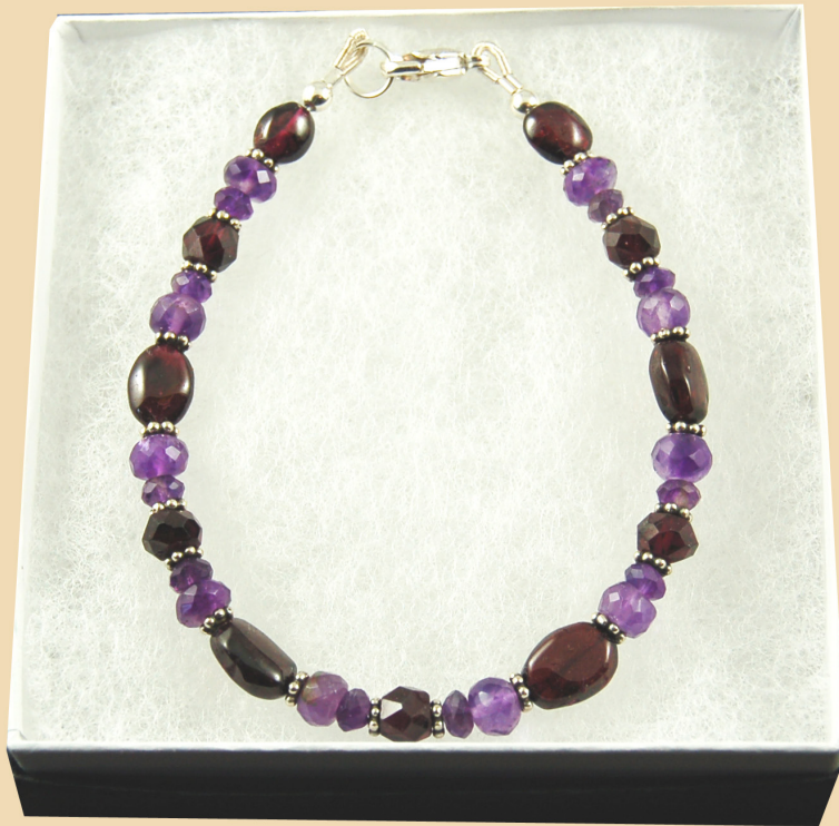
SB4 Garnet ovals and faceted Amethyst and Sterling Silver £50