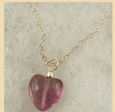
SP15 Purple Fluorite heart and Sterling Silver £22