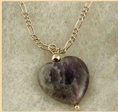
SP11 Purply Fluorite large heart and Sterling Silver £30