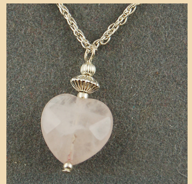
SP6 Rose Quartz faceted heart and Sterling Silver £30