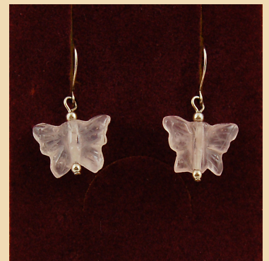
SE3 Rose Quartz butterflies and Sterling Silver £25