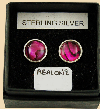
SS11 Red Abalone round and Sterling Silver £26