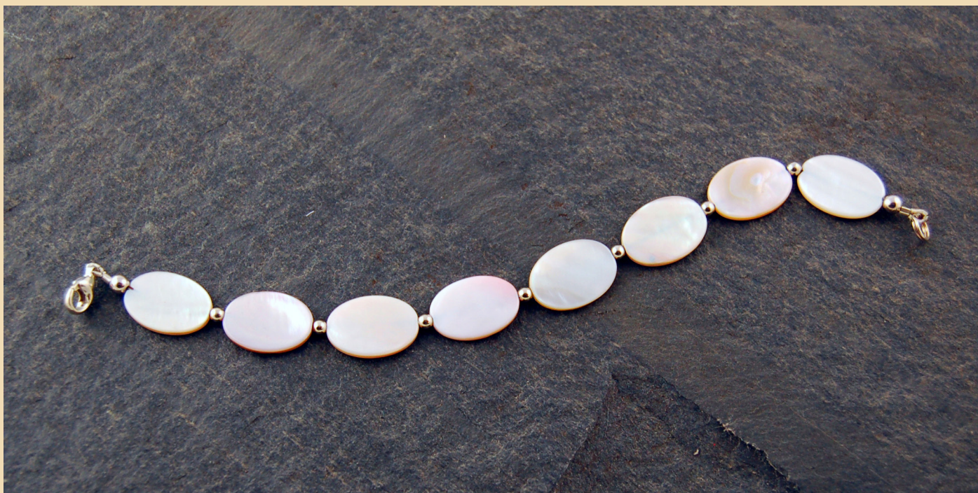
SB6 Pink Shell ovals and Sterling Silver £43