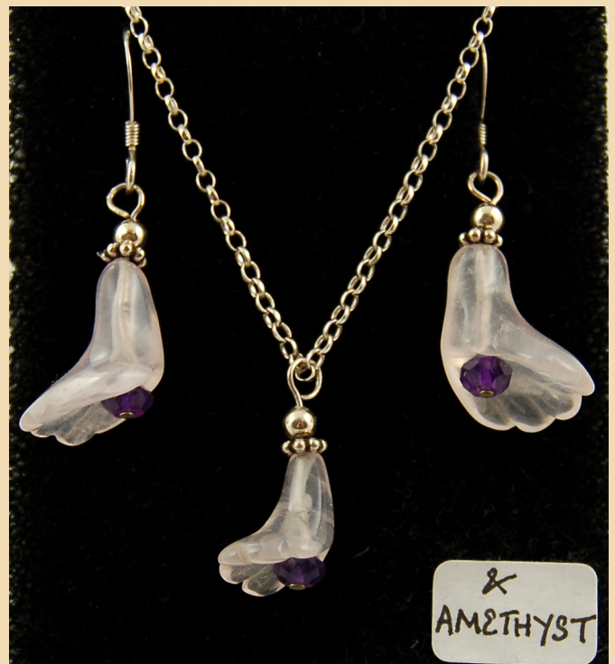
SSET 2 Rose Quartz flowers and Sterling Silver, pendant and earrings £50