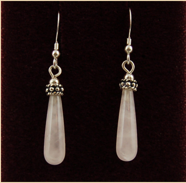
SE1 Rose Quartz drops and Sterling Silver £28