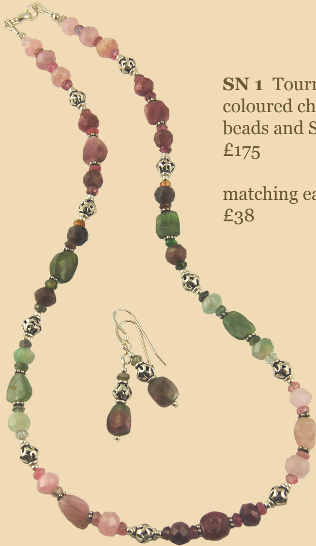
SN 1 Tourmaline multi-coloured chips and beads and Sterling Silver £175