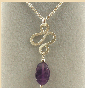
SP2 Carved Amethyst oval with frosted and hammered Sterling Silver squiggle £45