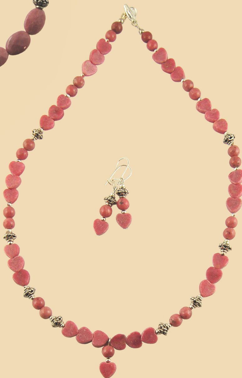
SN10 Rhodonite hearts and beads with drop, silver- plated £52