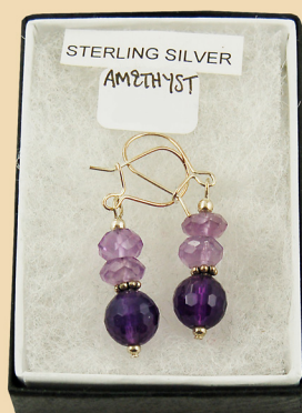
SE14 Amethyst faceted beads, pale and dark, and Sterling Silver £22