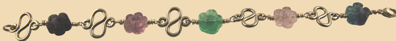
SB1 Fluorite flowers with Sterling Silver squiggles £75