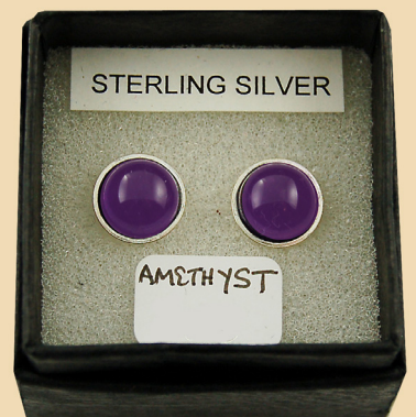
SS6 Dark Indian Amethyst round and Sterling Silver £38