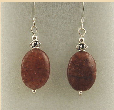
SE7 Muscovite ovals and Sterling Silver £24