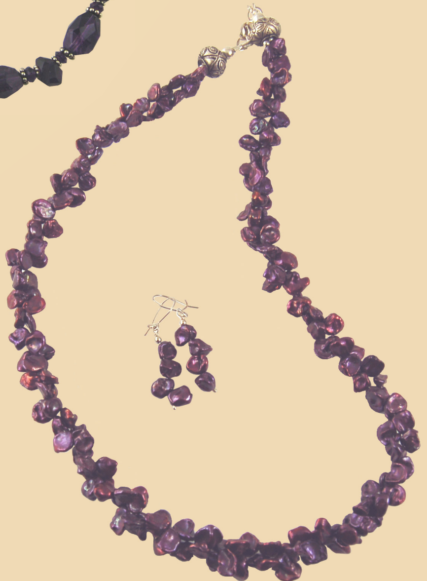
SN4 Purple dyed Keshi Pearls and Sterling Silver (double twist) £87