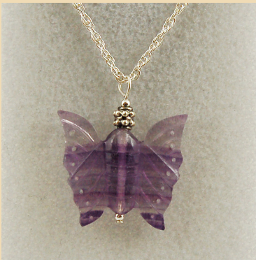
SP13 Purple Fluorite butterfly and Sterling Silver £45