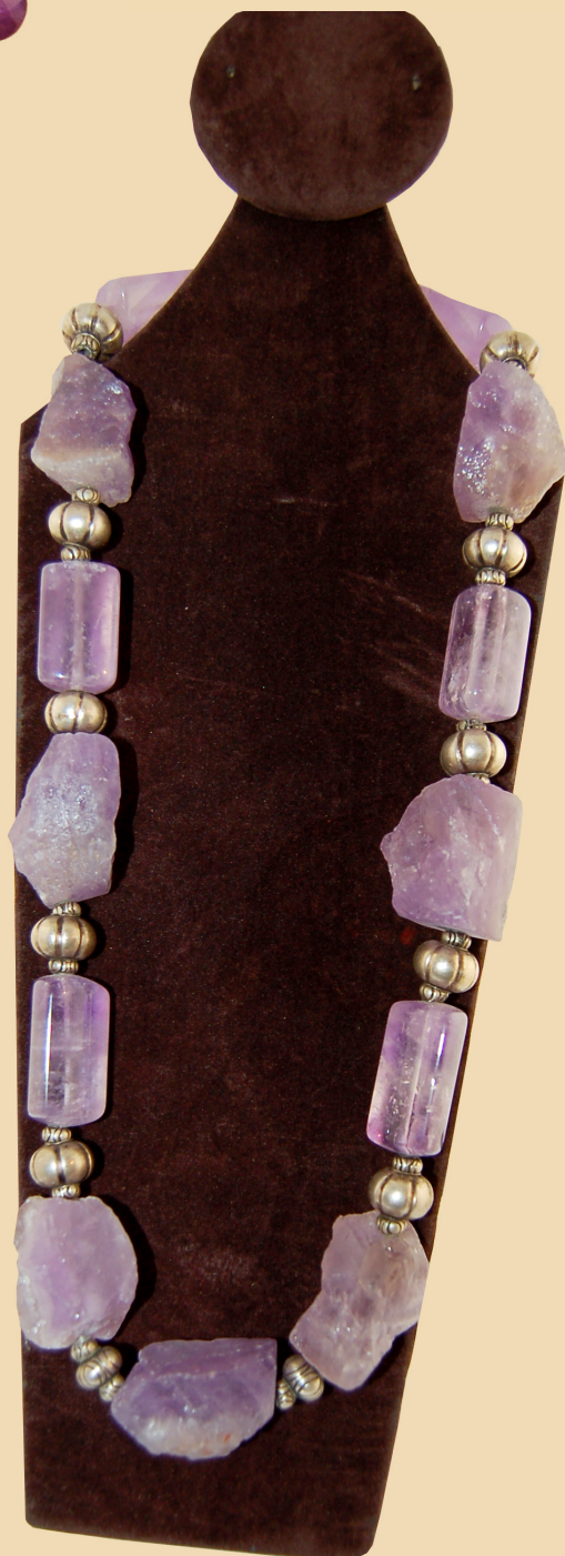
SN6 Amethyst large pieces rough and smooth and Sterling Silver £165