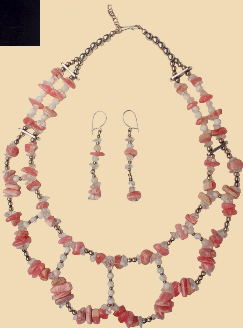
SN14 Rhodonite and Mother of Pearl collarette, silver-plated £94