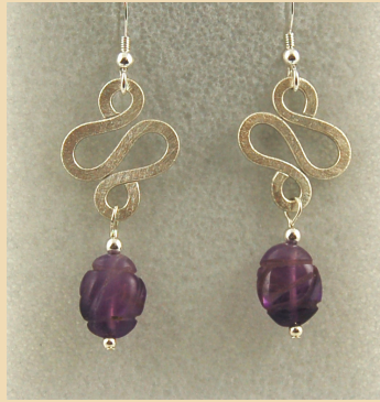
SE2 Carved Amethyst ovals with frosted and hammered Sterling Silver squiggle £48