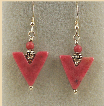
SE8 Rhodonite 'V' shape and Sterling Silver £25