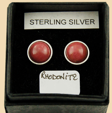
SS3 Rhodonite round and Sterling Silver £26