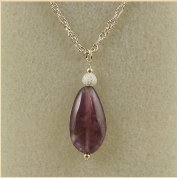
SP10 Amethyst teardrop and Sterling Silver £28