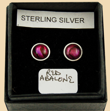
SS12 Red Abalone small round and Sterling Silver £24