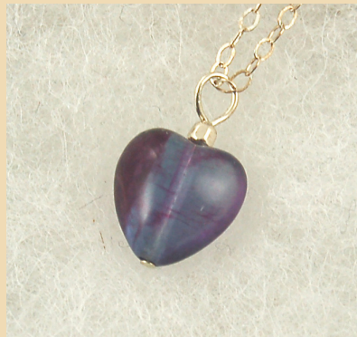
SP14 Blue Fluorite heart and Sterling Silver £22