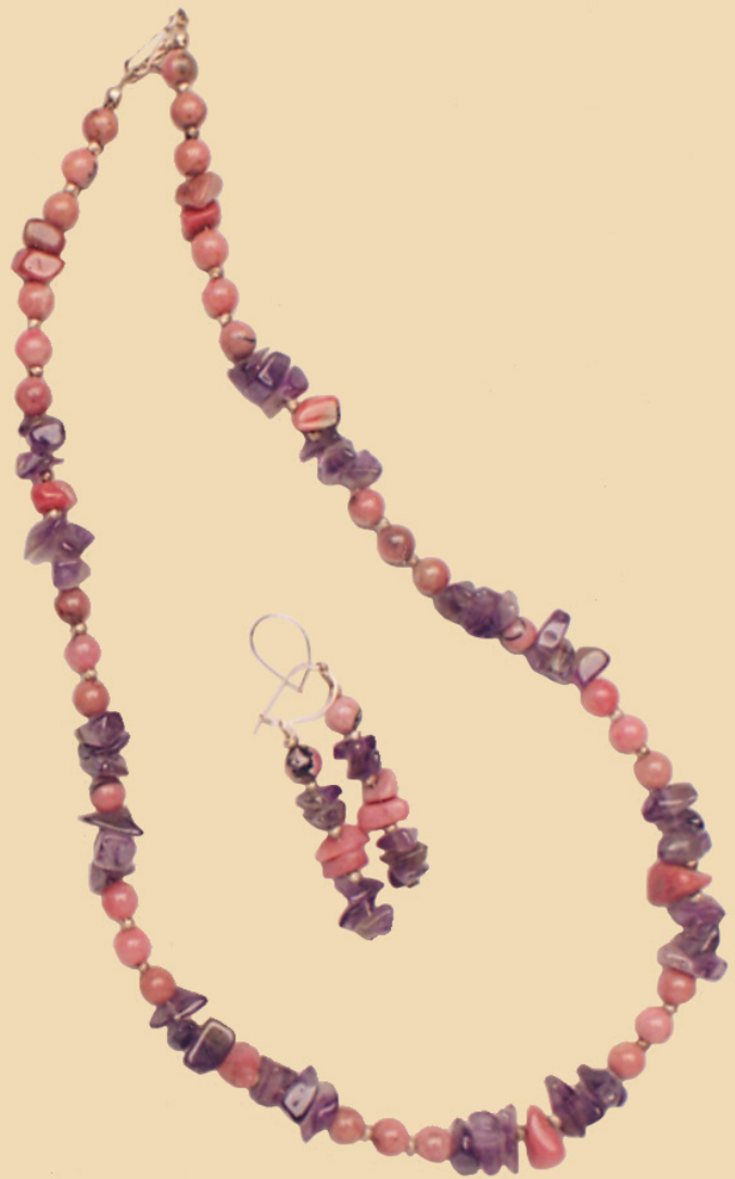
SN16 Rhodonite and Amethyst chips, silver-plated £50