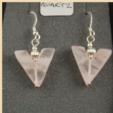
SE5 Rose Quartz 'V' shape and Sterling Silver £24