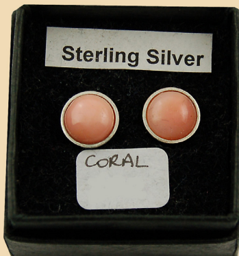
SS4 Pink Coral round and Sterling Silver £40