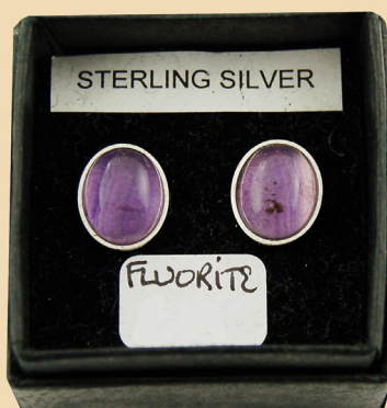
SS7 Fluorite oval and Sterling Silver £28