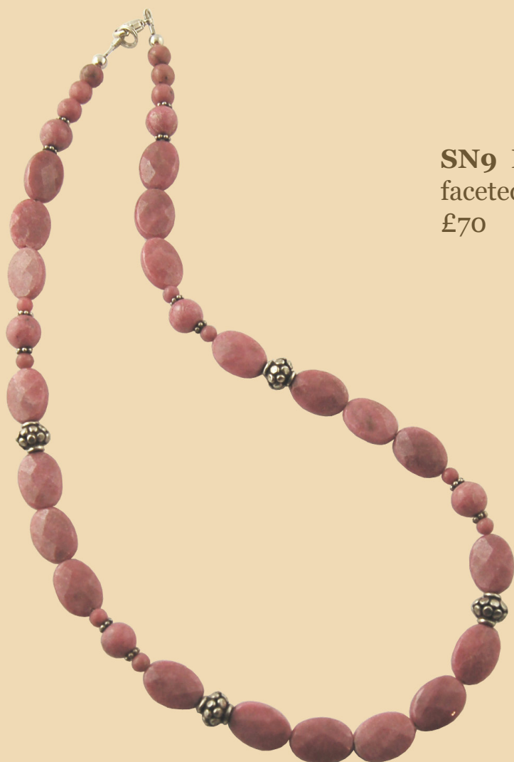
SN9 Rhodonite beads and faceted ovals and Sterling Silver £70