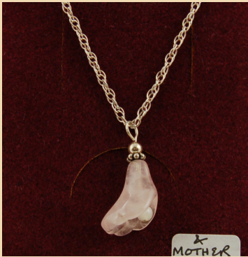
SP1 Rose Quartz flower and Sterling Silver £28