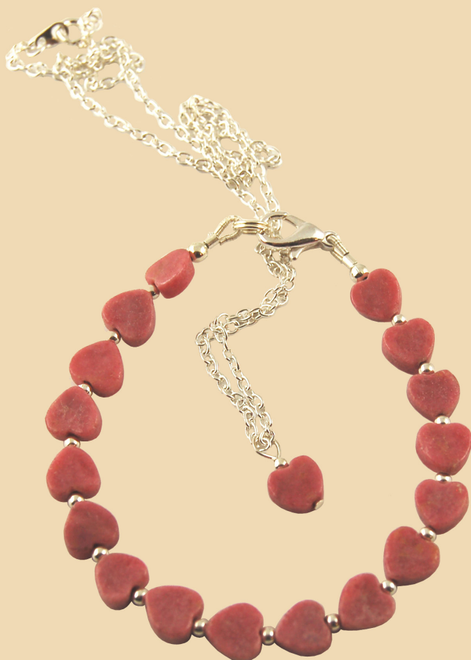
SB 8 Rhodonite hearts, silver-plated £38