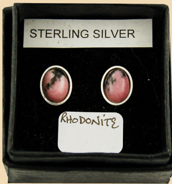
SS10 Rhodonite small oval and Sterling Silver £24