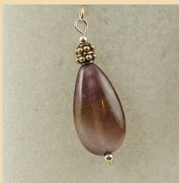
SE10 Amethyst teardrop and Sterling Silver £24