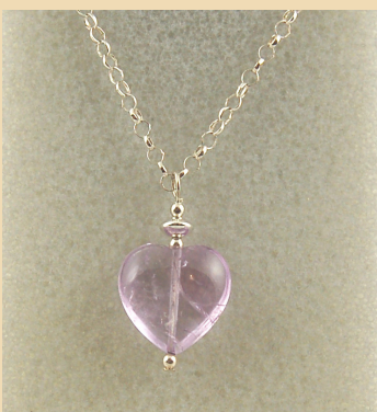
SP16 Amethyst heart and Sterling Silver £30